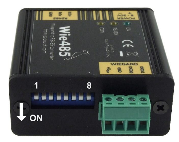
Fig. 2 - configuration switch position and ON position

Any change to the configuration parameters will apply after a power cycle.